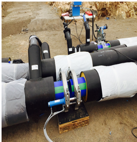
aquatherm blue pipe Ti is a socket fusion and butt welded system, using rigid prefabricated PUR foam insulation sockets.

Opened in the 1970's, Woodleigh High school, based at Langwarrin South (VIC) on the Mornington Peninsula, is an independent, progressive school with an emphasis on independent thought. The Woodleigh School Baxter Campus engaged a design team for the design of three new Homestead buildings to replace the existing. For the phase 2 works, Cundall in Melbourne was engaged to provide building services design. Phase 2 consisted of the demolition of three existing homesteads and construction of three new modern homestead buildings and associated plant. The works were planned to be carried out in stages.