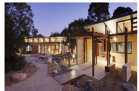
Woodleigh School Homestead

Aquatherm Australia Pty Limited supplied the approx. 1km of L= 5.8mtr. and L= 11.6 mtr. Ø32-Ø160 aquatherm blue pipe Ti pipes and fittings, via a 40' EX Germany sea freight container, directly on site. Free training, welding tools and site support were provided by Aquatherm technicians.