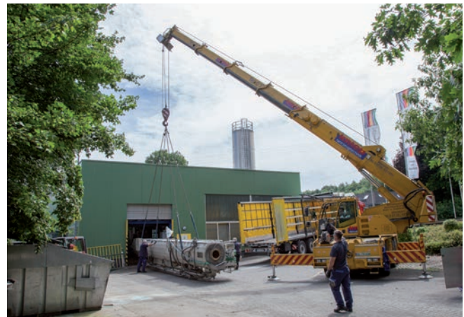
Loading of a ...