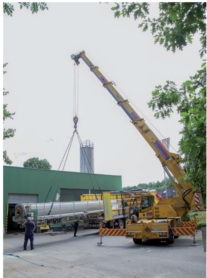
... vacuum tank