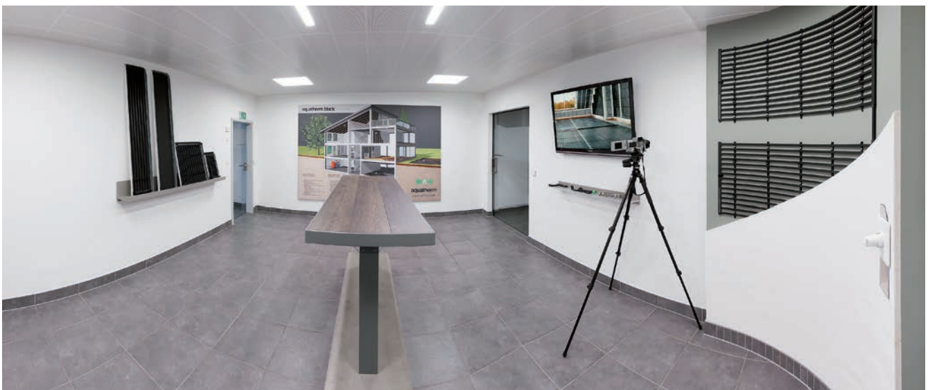
Room 2 demonstrates a single-color metal panel ceiling. Here the aquatherm black system is integrated as a square and rectangular panel with different lighting. Even the application in curves is impressively presented. An infrared camera visualizes the function of the heating and cooling panels for the visitors.