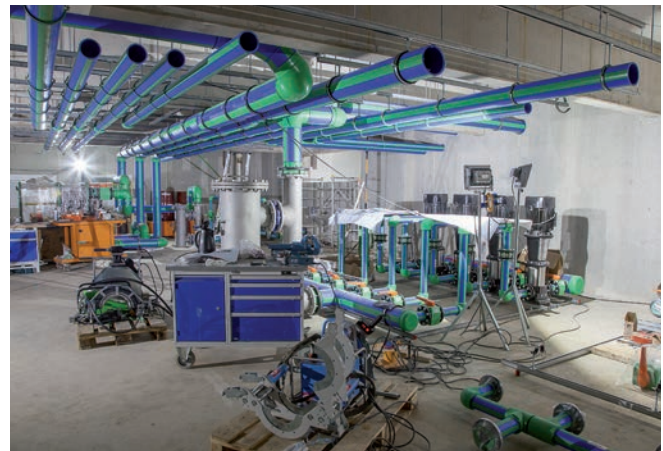
Cooling water treatment in the basement