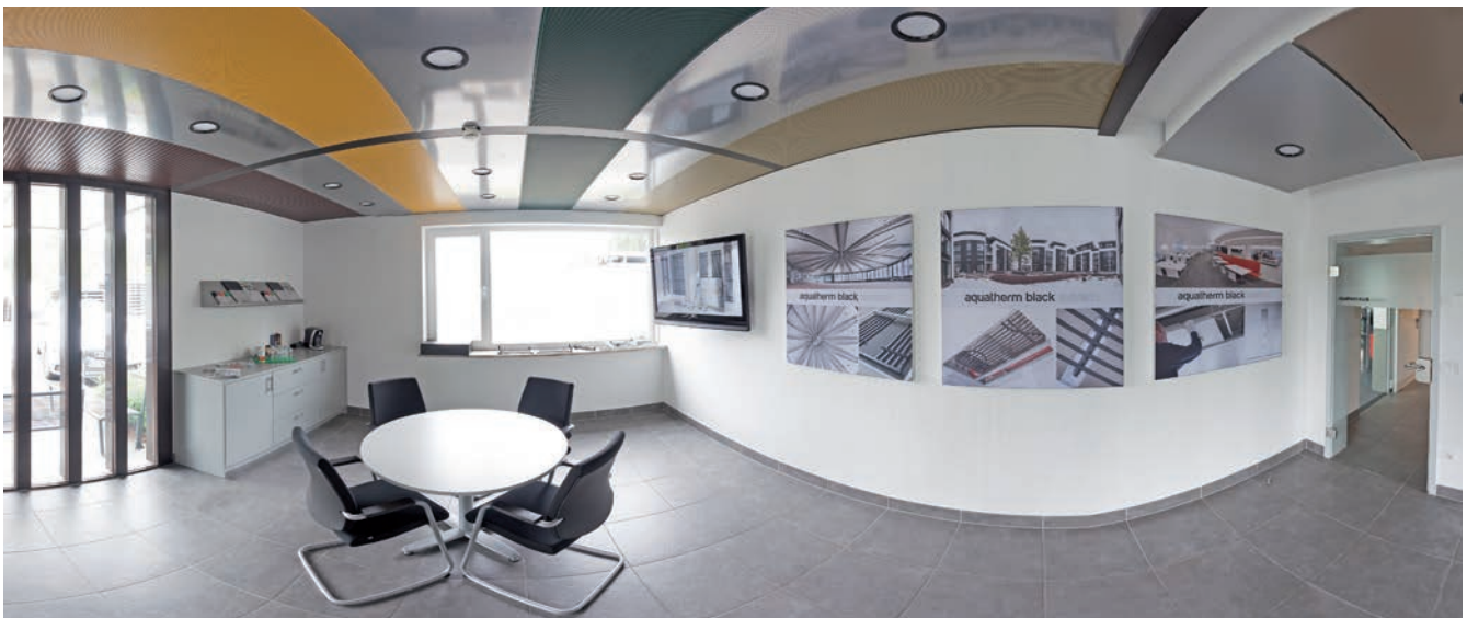
Room 1 shows the application of aquatherm black system in the world of metal panel ceilings for office and industrial area. Different formats, colors, perforations and ceiling sails are presented.

With black system aquatherm provides a universal applicable surface heating and cooling system for applications below the ceiling, at the wall and on the floor. The many different fields of application can be inspected in the newly built "aquatherm black system showroom" as of now. All applications are real in function. In the rooms the pleasant climate is noticeable by radiation, either for the field of "heating" or "cooling".