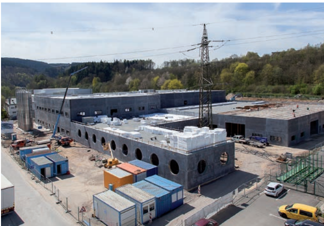
View from the technical office